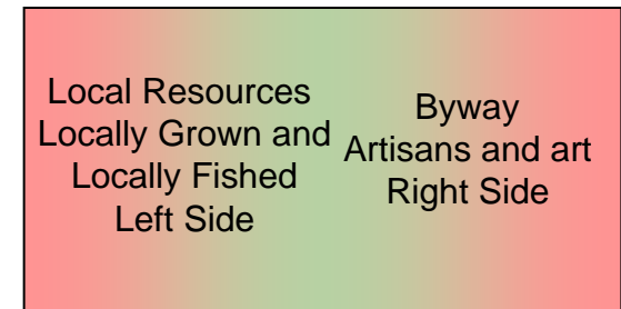
D. Replace, replacement lobster panel At Frenchman Bay Overlook