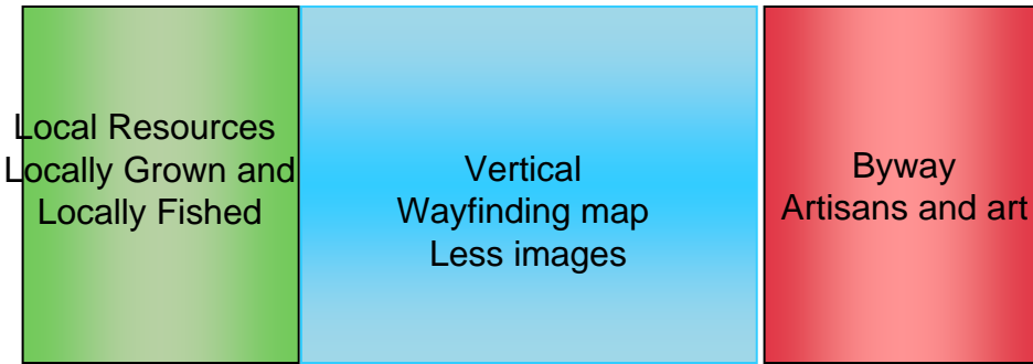
A. 4'6 x 2' Behind Rock at Gateway Site