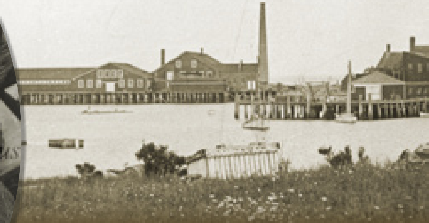
CANNING SARDINES and even lobster Pis alis am iustrud min hendre minci tat nonsed tat, sis doluptat. Ut adigna feum