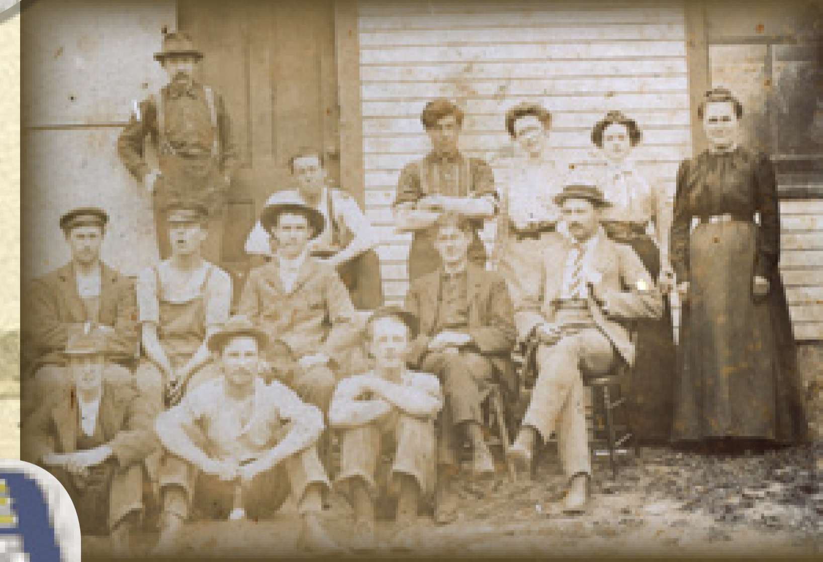
GENERATIONS LINKED TO THE SEA From fishing to canning to lobstering, iustrud min hendre minci tat nonsed tat, sis doluptat.